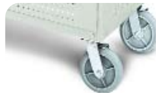
NOTEBOOK CARTS CAN BE ORDERED WITH 8" RUBBER CASTERS PERFECT FOR MOVING LAPTOPS ACROSS CAMPUS A0287484