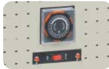
LAPTMR AUTOMATIC TIMER ALLOWS BOTH CHARGING UNITS TO BE PLUGGED INTO THE TIMER

Electrical units are UL and C-UL listed, overload protected, includes a 20' power cord, and has an on/off switch located at the base. When using both electrical units at the same time, each unit must be plugged into outlets on separate electrical circuits. This is to prevent the overload and tripping of the circuit breaker. The electrical units are rated for a maximum of 15 amps usage each, however, to prevent nuisance tripping of the breaker you should not exceed 13 amps of usage each for an extended period of time.